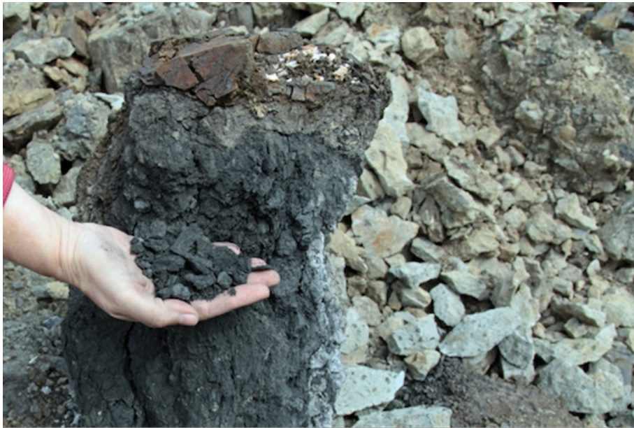
Fig. 2: an end-Permian smoking gun? One of countless masses of part-combusted coal enclosed by basalt of the Siberian Traps.

It is important to record that recent research has found that, although the Siberian Traps eruptions waxed and waned over a few million years, the extinction itself took place over a much shorter time-span. More importantly, that time-span, about 60,000 years in length, took place after the most voluminous stage of lava-extrusion, which had no great affect on biodiversity apart from in the immediate district. For reasons still imperfectly understood, just prior to the extinction the magma, instead of erupting at the surface, started to intrude the rocks through which it was passing, deep beneath the ground, to form perhaps the greatest complex of sills anywhere on Earth - a sill being a flat-lying intrusive sheet of igneous rock anything from centimetres to over a kilometre in thickness.