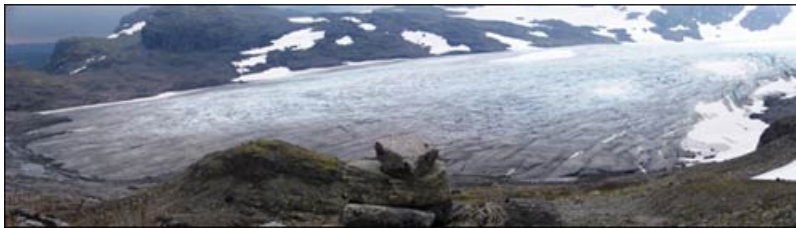
(Figure 1: Midtdalsbreen, Southern Norway)

Glaciers are large viscous masses of ice which creep naturally through a process called internal deformation. This "creep" or movement is caused by gravity and the weight of accumulated snow and ice forcing the ice to deform like plastic.